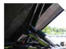
BODY RAISE INDICATOR