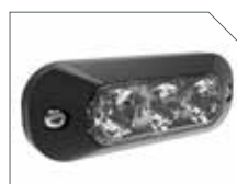
FRONT STROBE LIGHTS