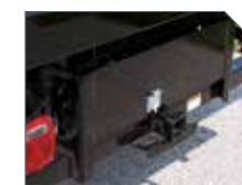
CLASS V RECEIVER HITCH