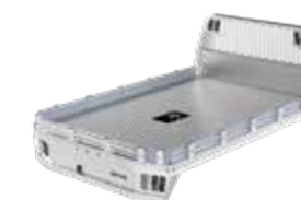
ALUMINUM 6" HIGH SIDES