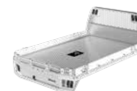
ALUMINUM DROP SIDES