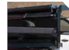
STRAIGHT FULL CAB PROTECTOR