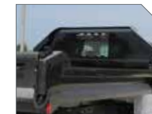
TAPERED QUARTER CAB PROTECTOR