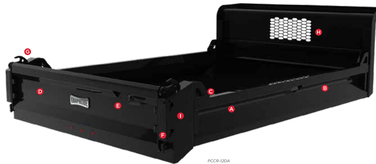
PCCR-12DA *Body may be shown with optional features

constructed of 10-gauge high tensile steel with a punched window for visibility