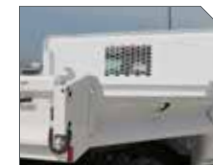
STRAIGHT QUARTER CAB PROTECTOR

-P denotes prime paint; -B denotes black finish paint. GM C/K 3500 chassis applications