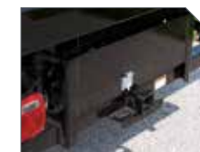
CLASS V RECEIVER HITCH