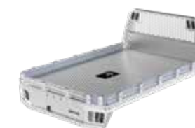
ALUMINUM 6" HIGH SIDES